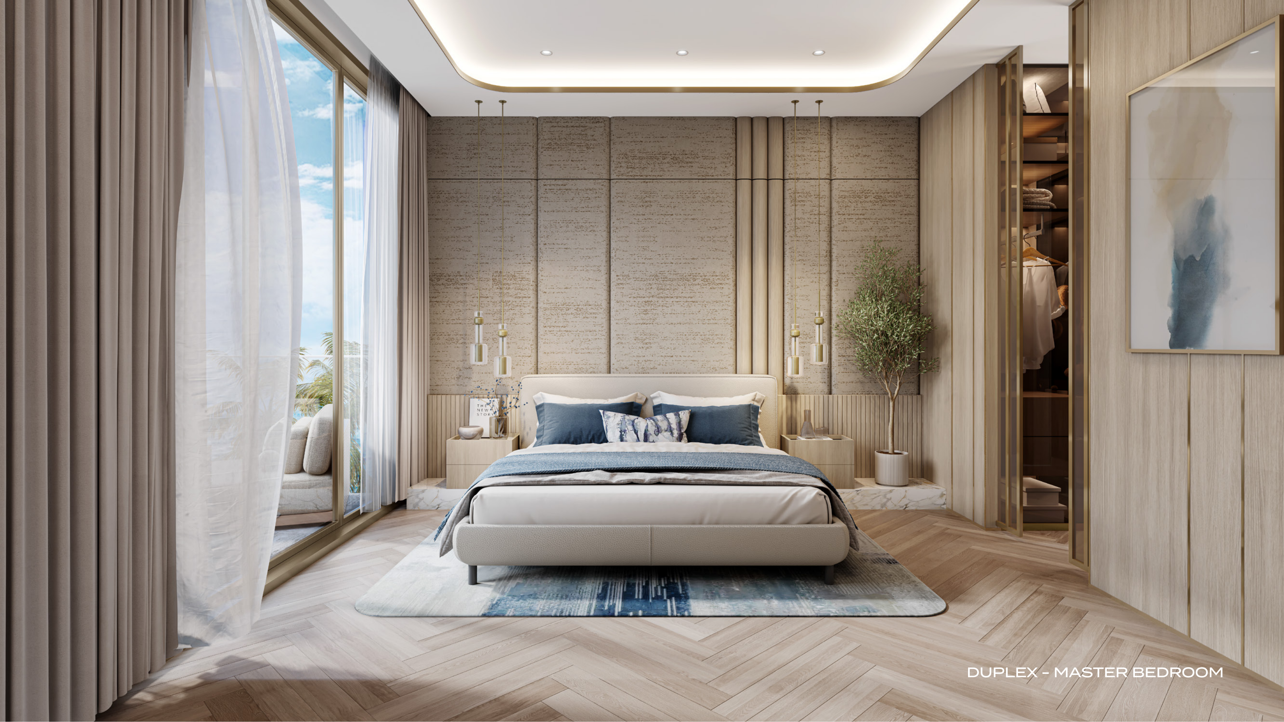
DUPLEX - MASTER BEDROOM