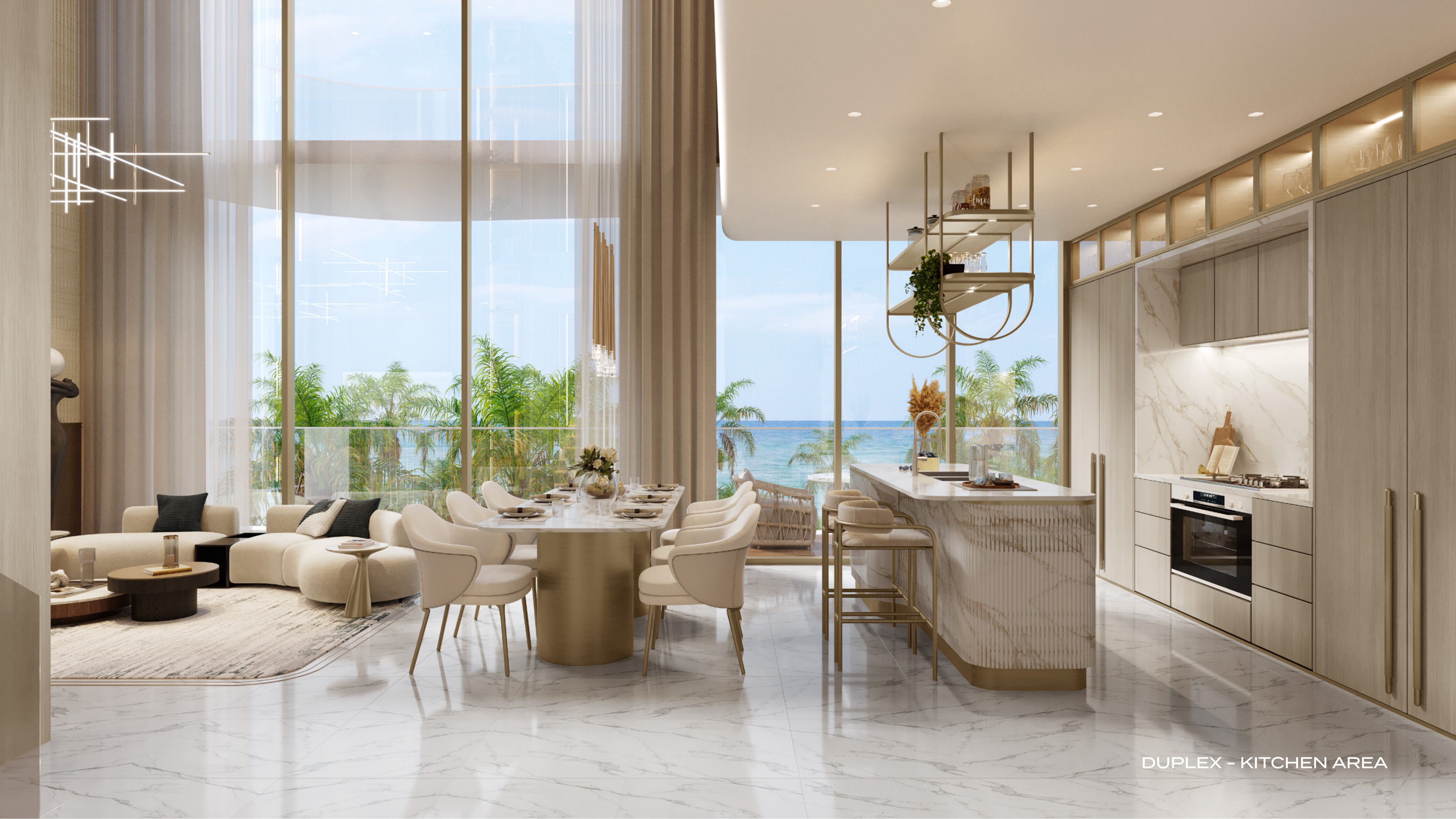
DUPLEX - KITCHEN AREA