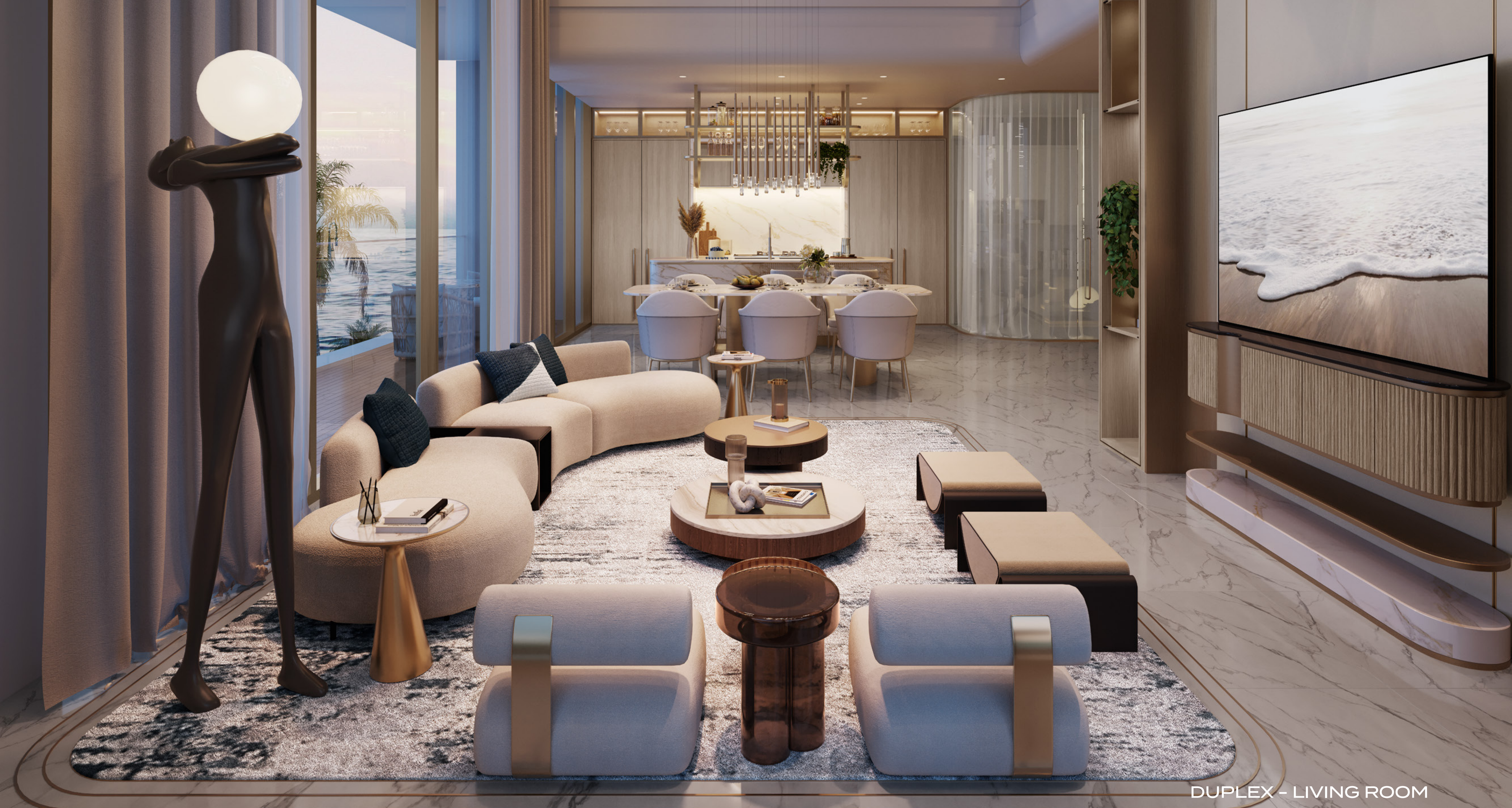
DUPLEX - LIVING ROOM